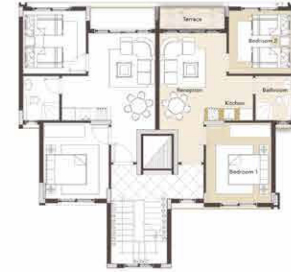
Typical Floor 72 m 2