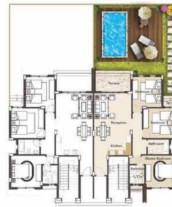
Ground Floor 135 m 2