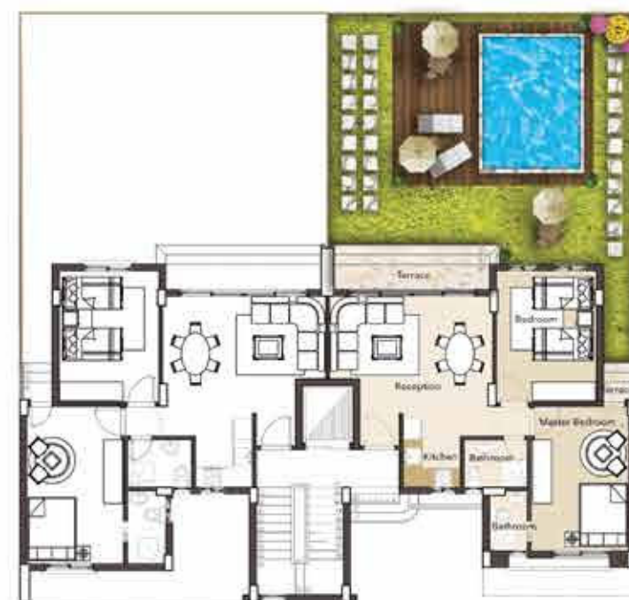
Ground Floor 100 m 2