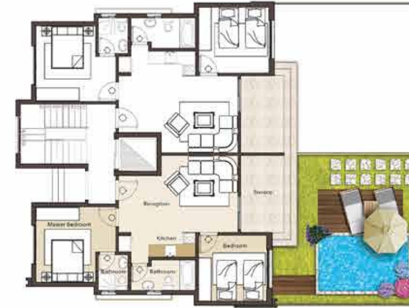
Ground Floor 85 m 2