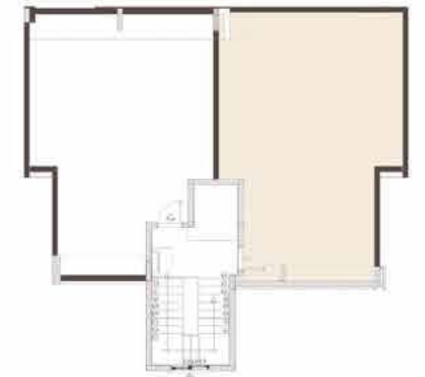
Roof Garden 61 m 2