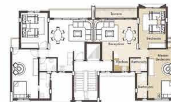
Typical Floor 105 m 2