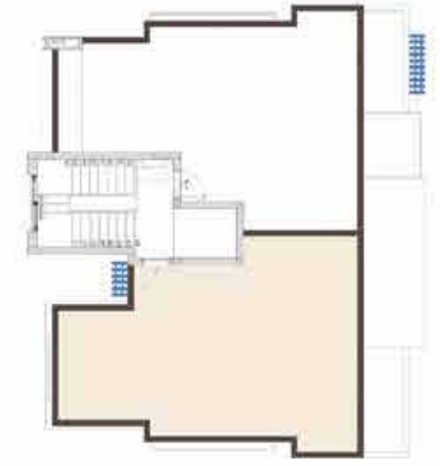
Roof Garden 57 m 2