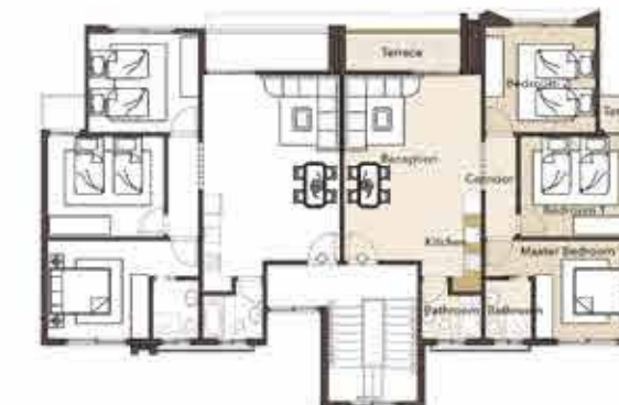
Typical Floor 120 m 2