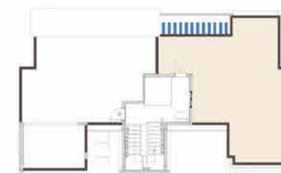
Roof Garden 68 m 2