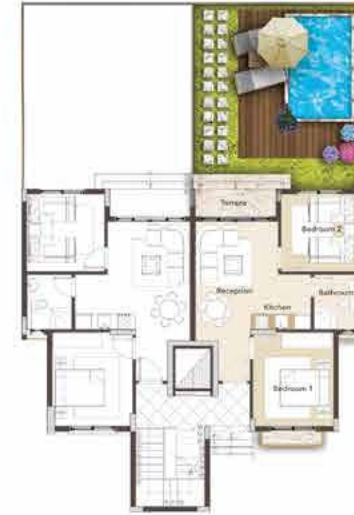
Ground Floor 72 m 2