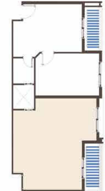
Roof Garden 42 m 2