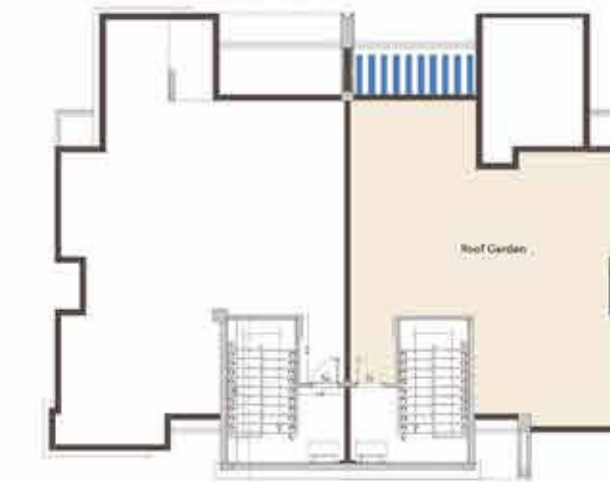
Roof Garden 119 m 2