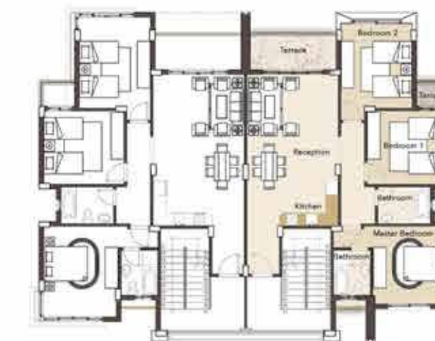
First Floor 140 m 2