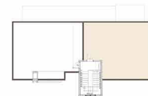
Roof Garden 90 m 2