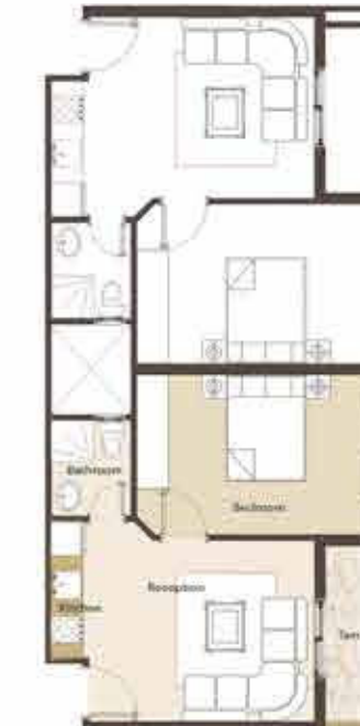
Typical Floor 57 m 2