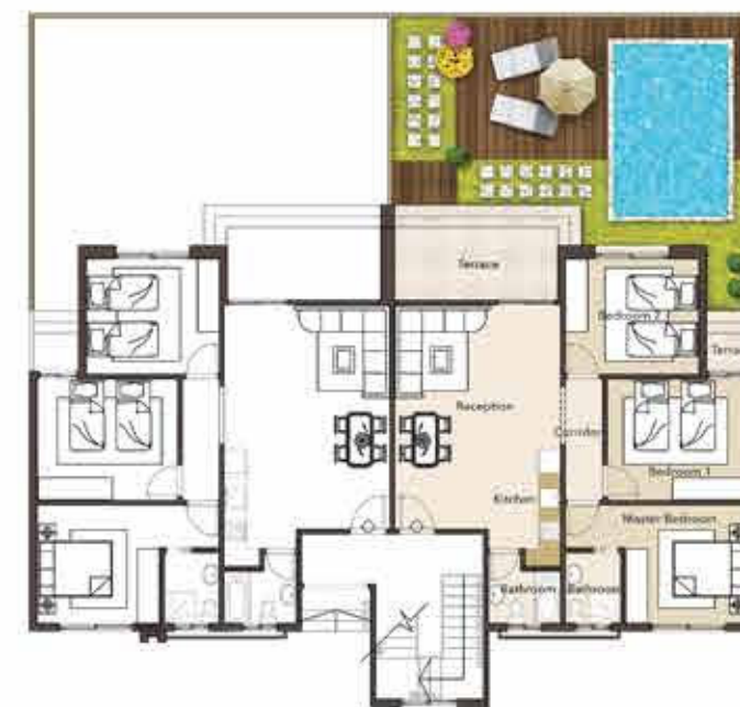
Ground Floor 120 m 2