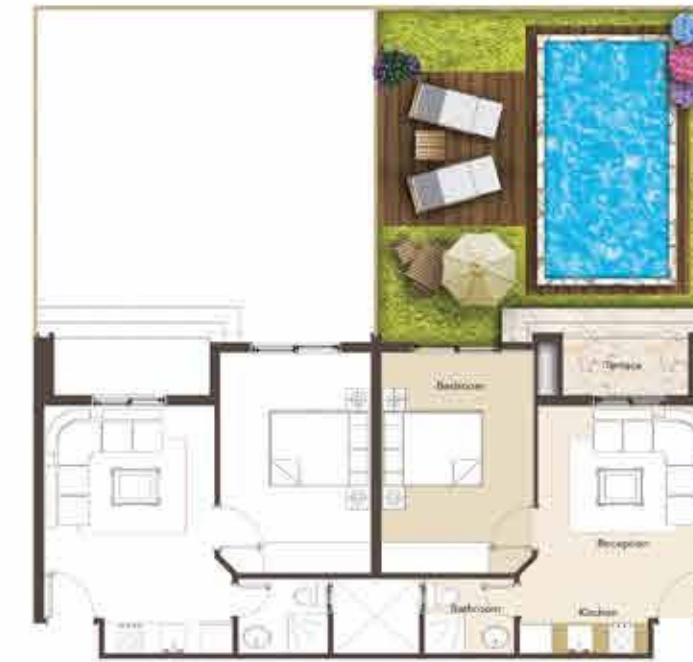
Ground Floor 57 m 2