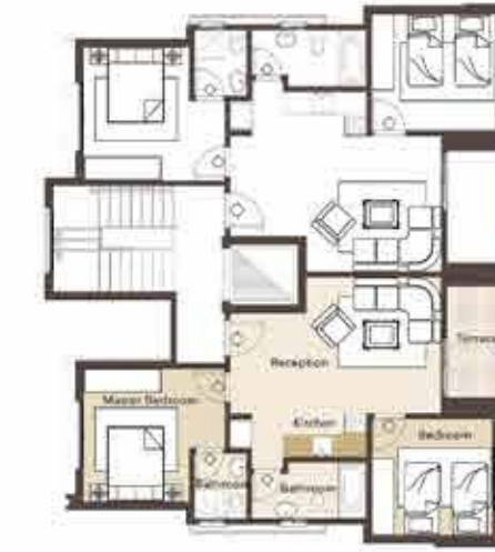
Typical Floor 85 m 2